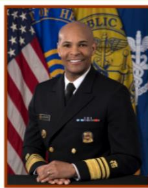
"Returning to a New Normal Following a Pandemic" Jerome Adams, MD, MPH