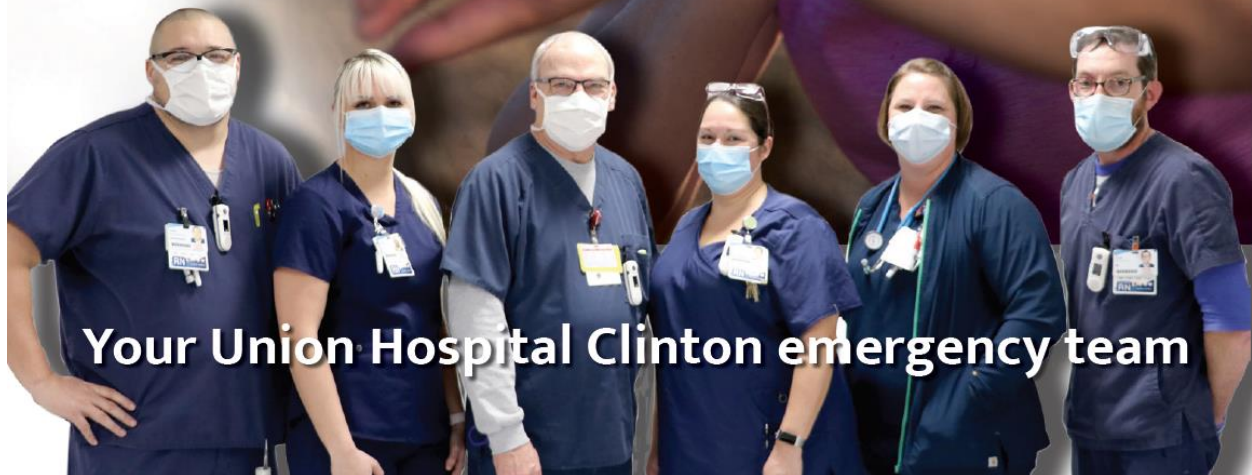
Your Union Hospital Clinton emergency team