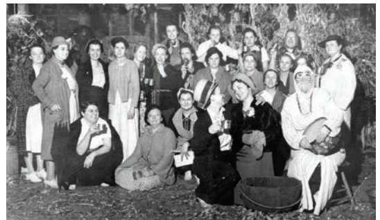
1938 - A festive Halloween party held at ACMH