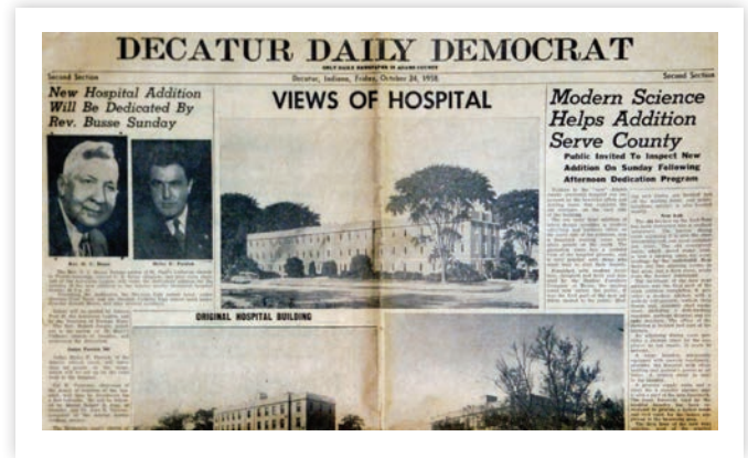
1958 - Headlines for dedication of hospital addition

Alfred Beavers Oil Service, American Sterilizer Company, *Baker Plumbing and Heating, Burk Elevator Company, Citizens Telephone Company, Cloverleaf Creameries, *Commercial Print Shop, Decatur Farms, Holthouse Drug Company, Hospital Record Company, Kohne Drug Store, Schafer Store, Schmitt Locker Service, Seven Up Bottling Company, E.R. Squibb & Sons, Stewart's Bakery. * still in business today