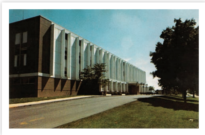
New Addition to the hospital was completed in 1958

1957 (November 4) - Specifications of equipment for the new addition of the hospital were revealed including items for the following areas: Surgery, Lab, X-ray, Kitchen, Laundry, Dining Room, and Nursery and Delivery.